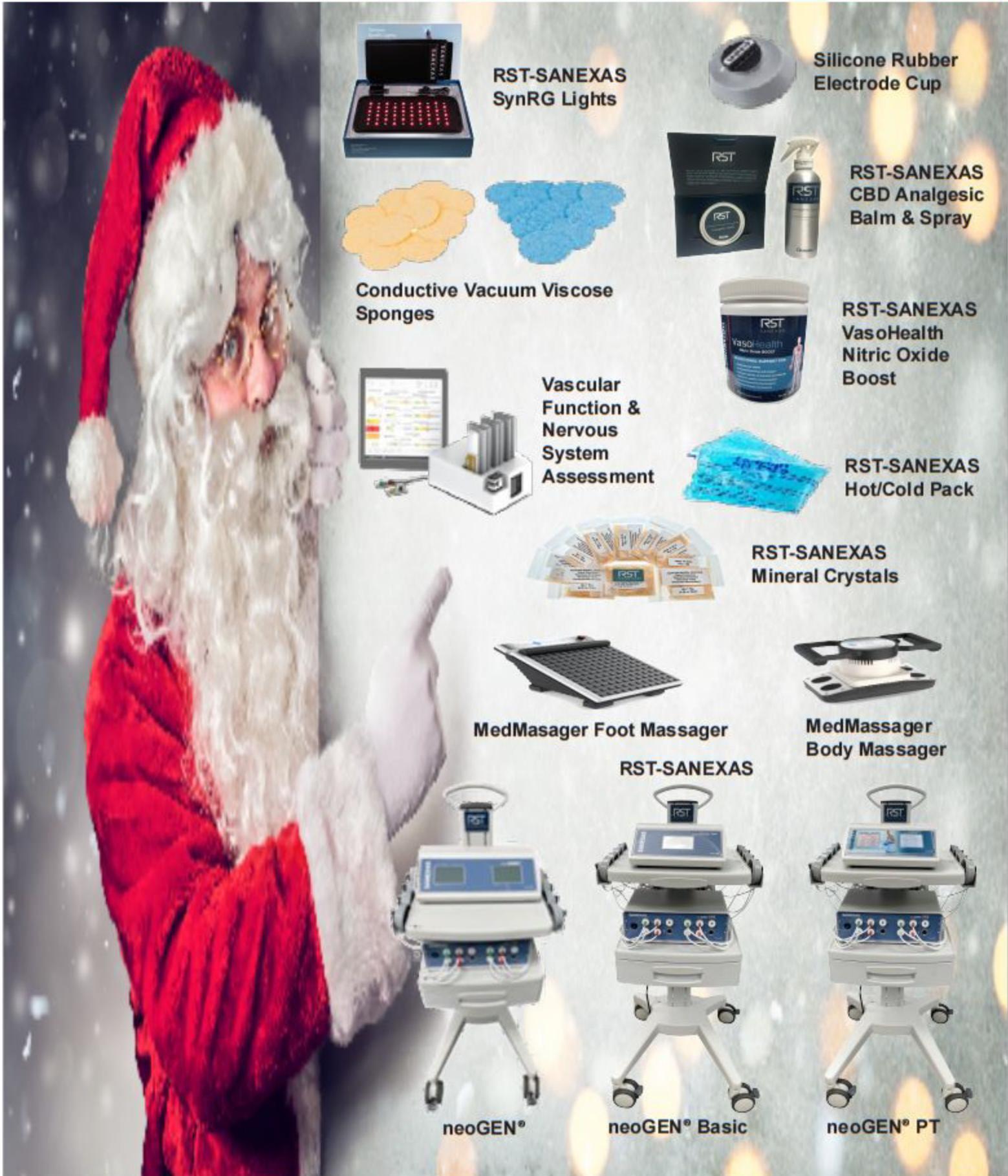
RST-SANEXAS SynRG Lights