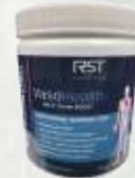
RST-SANEXAS VasoHealth Nitric Oxide Boost