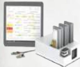
Vascular Function & Nervous System Assessment