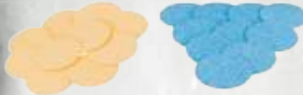
Conductive Vacuum Viscose Sponges