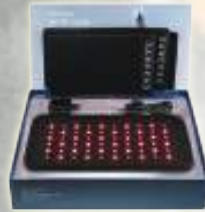
RST-SANEXAS SynRG Lights