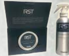
RST-SANEXAS CBD Analgesic Balm & Spray